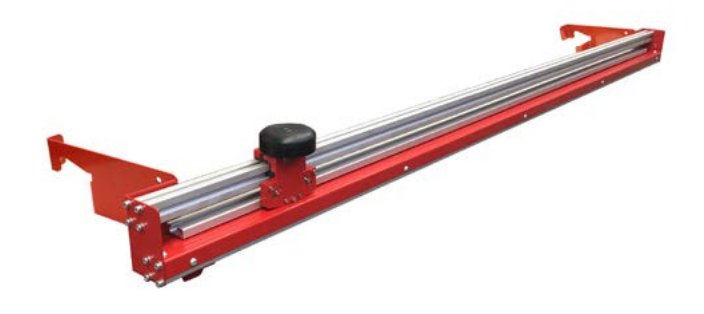
REF : PHTIWRC