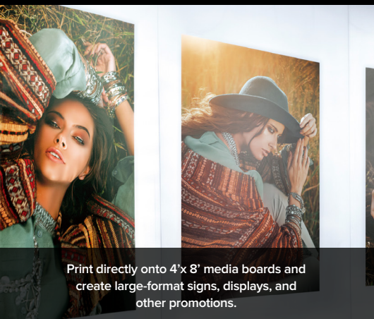
Print directly onto 4' x 8' media boards and create large-format signs, displays, and other promotions.

Print high quality graphics at incredible speeds directly onto 4' x 8' media boards with a 4.3-inch height clearance. Built tough for non-stop print production, the IU-1000F is a machine you can build your business around.