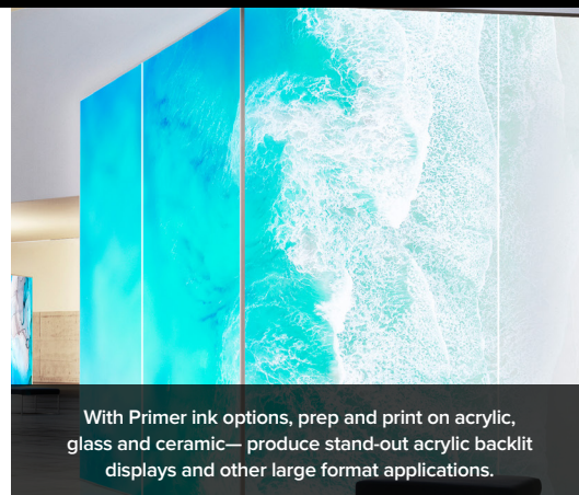
With Primer ink options, prep and print on acrylic, glass and ceramic— produce stand-out acrylic backlit displays and other large format applications.