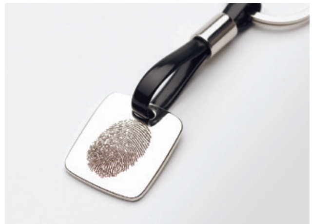
Marking individual individual pieces

With the laser markers of the U series you can mark individual single pieces as well as small and medium series quickly and easily. Thanks to the maintenance-free fiber laser source, plastic can be recolored and metal permanently marked directly – without the use of sprays or pastes.