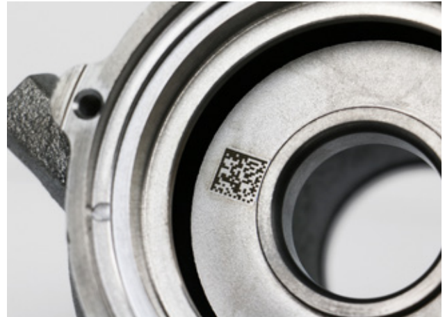
Marking in recesses thanks to long focus distance