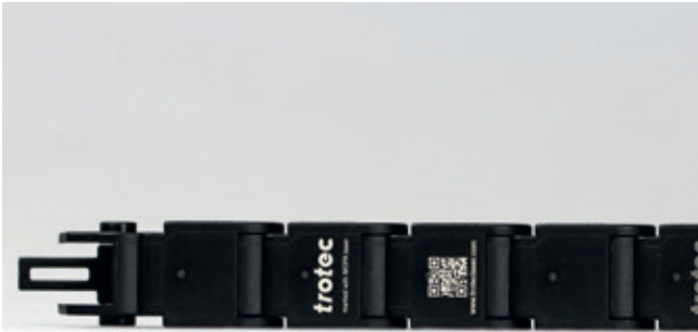
Precise marking – even with the smallest font sizes